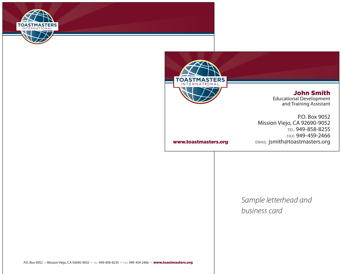
Sample letterhead and business card

Your support in following these branding and copyright guidelines is greatly appreciated.